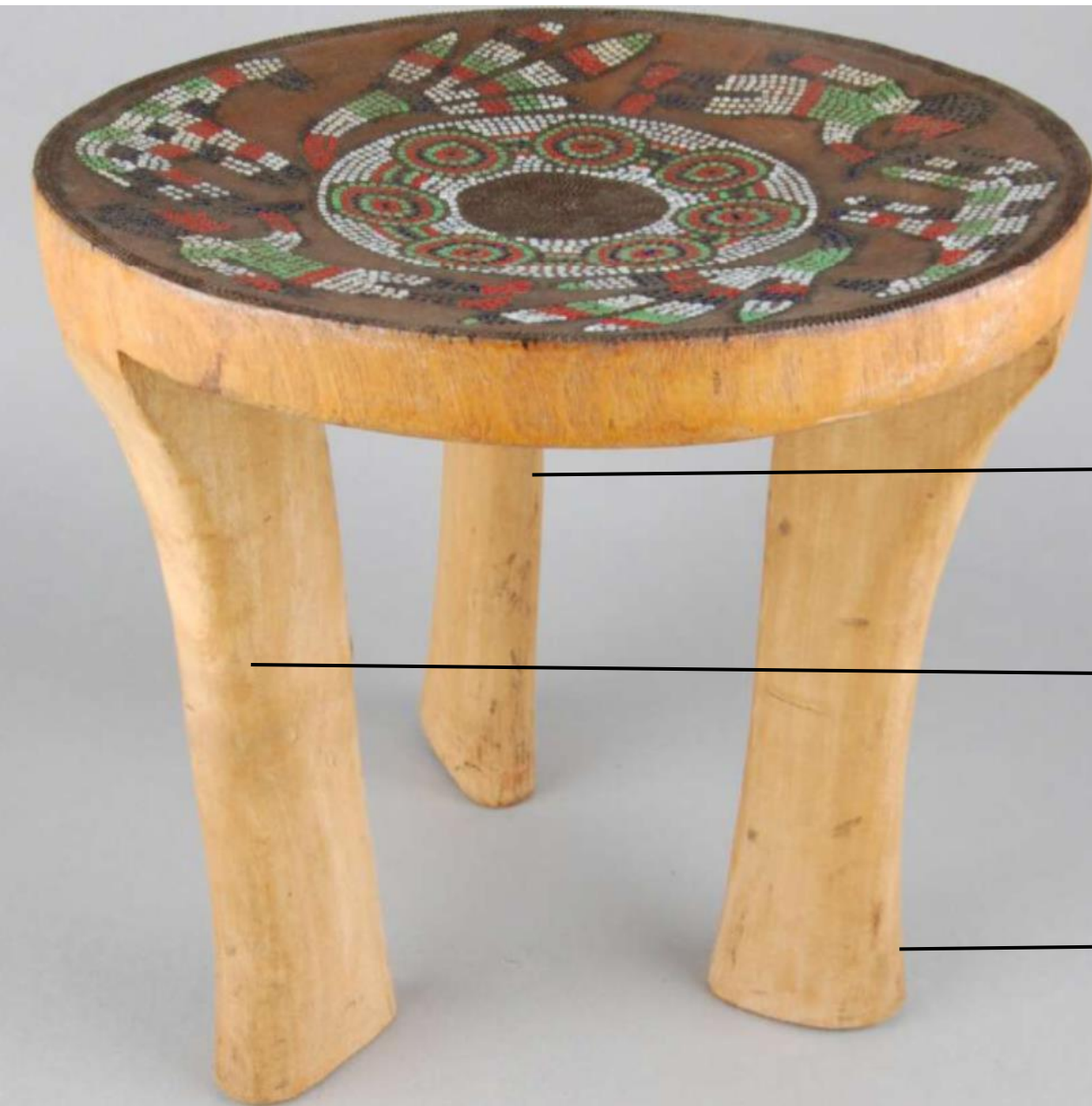
Three-legged carved wooden stool with circular seat

Leg 1: Respect for Environment and the life it sustains; Respect for all including marginalized groups