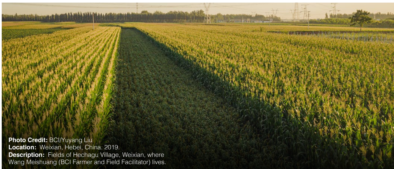
Location: Weixian, Hebei, China. 2019. Description: Fields of Hechagu Village, Weixian, where Wang Meishuang (BCI Farmer and Field Facilitator) lives.